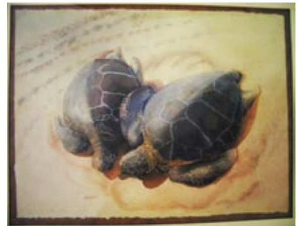
San Diego Natural History Museum

Reach reporter Kehau Cerizo at 760.752.6749.