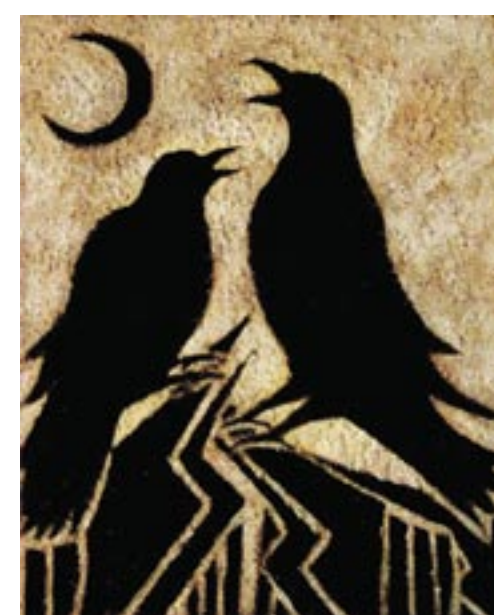
San Diego Natural History Museum